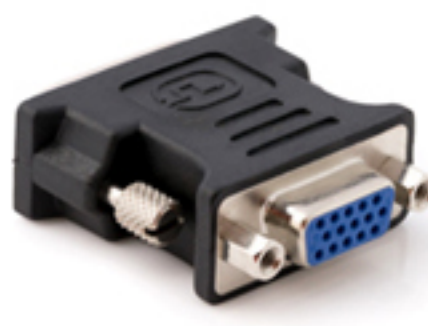
2.54mm DIP switch (SPST) gold-pin 2 positions