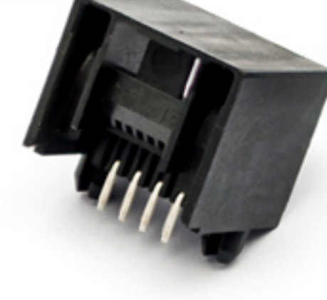
2.54mm DIP switch (SPST) gold-pin 2 positions