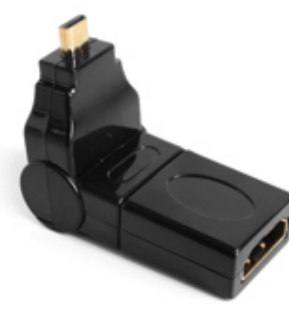
2.54mm DIP switch (SPST) gold-pin 2 positions