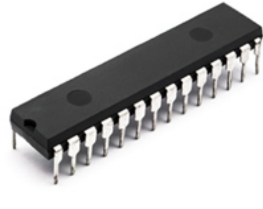
2.54mm DIP switch (SPST) gold-pin 2 positions