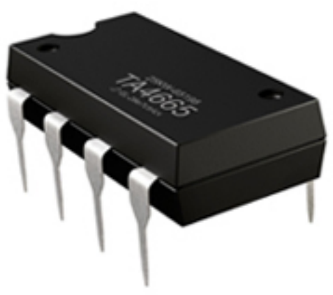
2.54mm DIP switch (SPST) gold-pin 2 positions