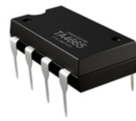
2.54mm DIP switch (SPST) gold-pin 2 positions