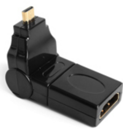
2.54mm DIP switch (SPST) gold-pin 2 positions