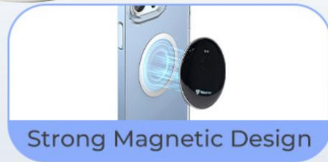
Strong Magnetic Design