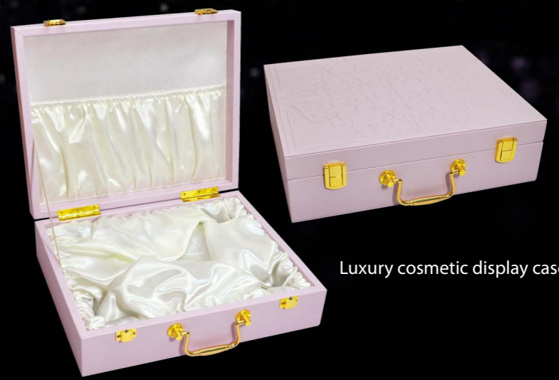
Luxury cosmetic display cases

Sanjiang, your trustworthy friend and a brand Swarovski, Rolex, Pandora, Kenzo, Dior, Givenchy and Sephora rely on