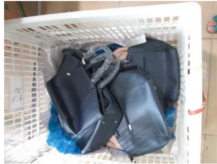
11. Finished product storage area