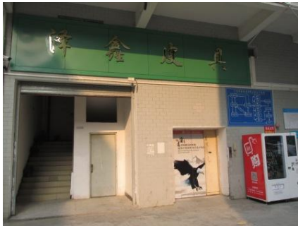
1. Factory entrance