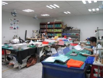
2. Sample making workshop