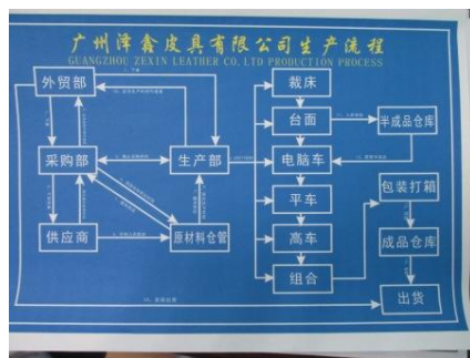
20. Flow chart of manufacturing processes