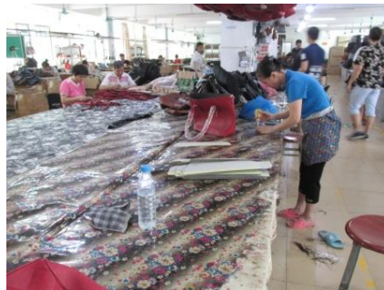
8. Hand working area