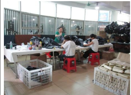
9. Inspection and trimming area