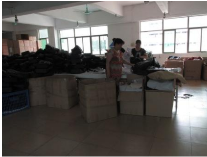
10. Assembly and packing area