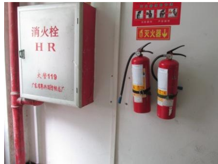
17. Fire fighting equipments