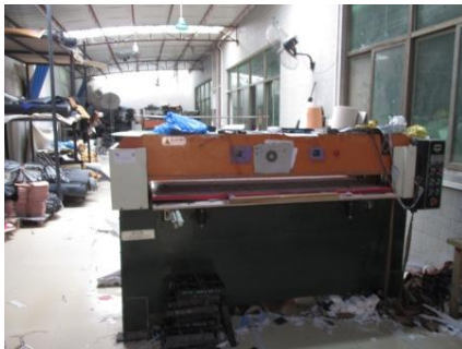
4. Cutting workshop