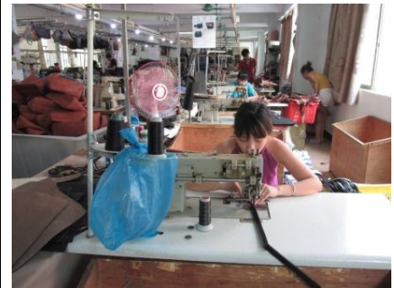
6. Sewing area