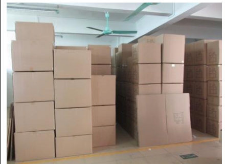
12. Defective products