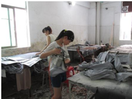
7. Spraying room