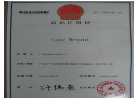
18. Trade mark (Lane Bryant)