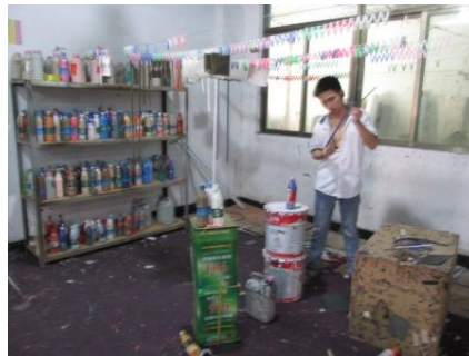
5. Edge painting area.