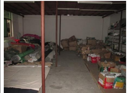
3. Material warehouse