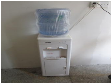
16. Drinking water