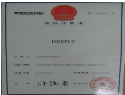
19. Trade mark (DEEPLY)