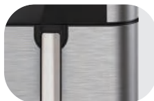
Stainless Steel Version