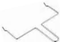
With fetch tool