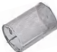
2.9L rotating round basket