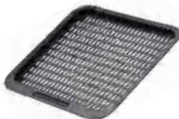
Non-stick crisper tray