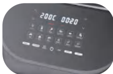
Add preset menus