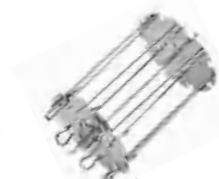
Rotisserie Skewer Set