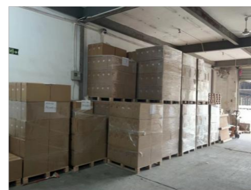
Hong Kong stock

As a renowned mining hardware supplier, MinersKing has established multiple warehouses across Mainland China, Hong Kong, and Russia. Moving forward, MinersKing plans to further expand its global presence by setting up additional warehouses worldwide.