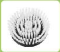
Large brush Living room floor use