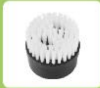
Small brush Clean gas hood for use