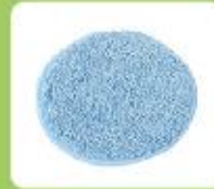
Cloth Clean the window