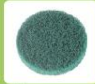
Fibre sponge Cleaning heavy oil stains