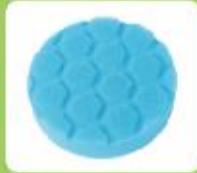
Sponge Clean the table