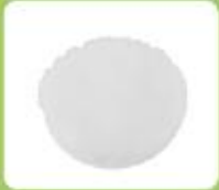
Wool cloth Used when cleaning the car