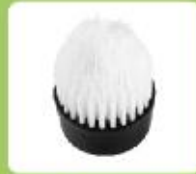
Pointed brush Used when cleaning corner