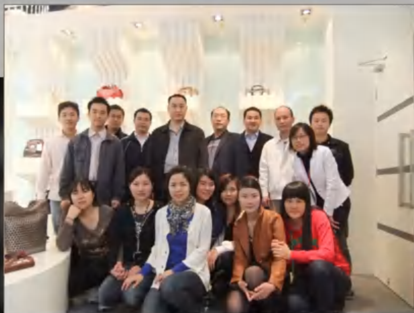
Sales Team 业务团队