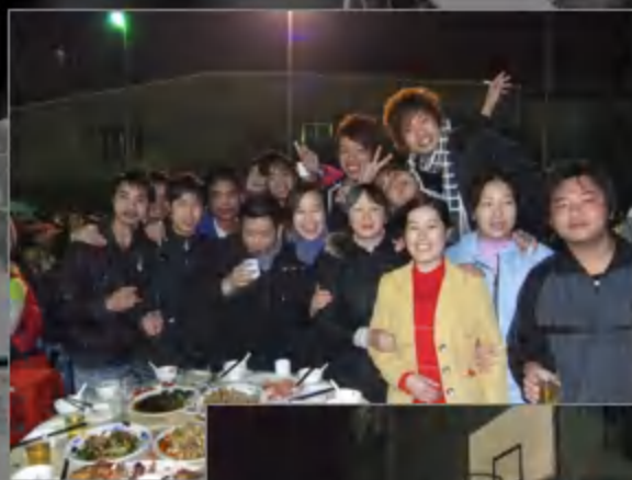
Lovely Staff Team for Party 可爱的员工团队在欢庆

● Corporate Spirit - Honest & Pragmatic, Team work, Hard work, Bigger & Stronger 企业精神 - 厚德务实 团结拼搏 做大做强