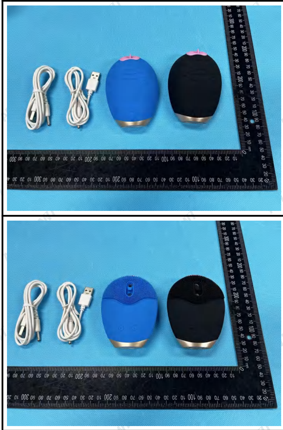
The photo of the sample