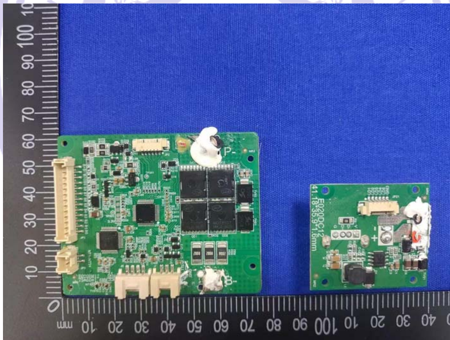
Photo 6 Protection board 保护板