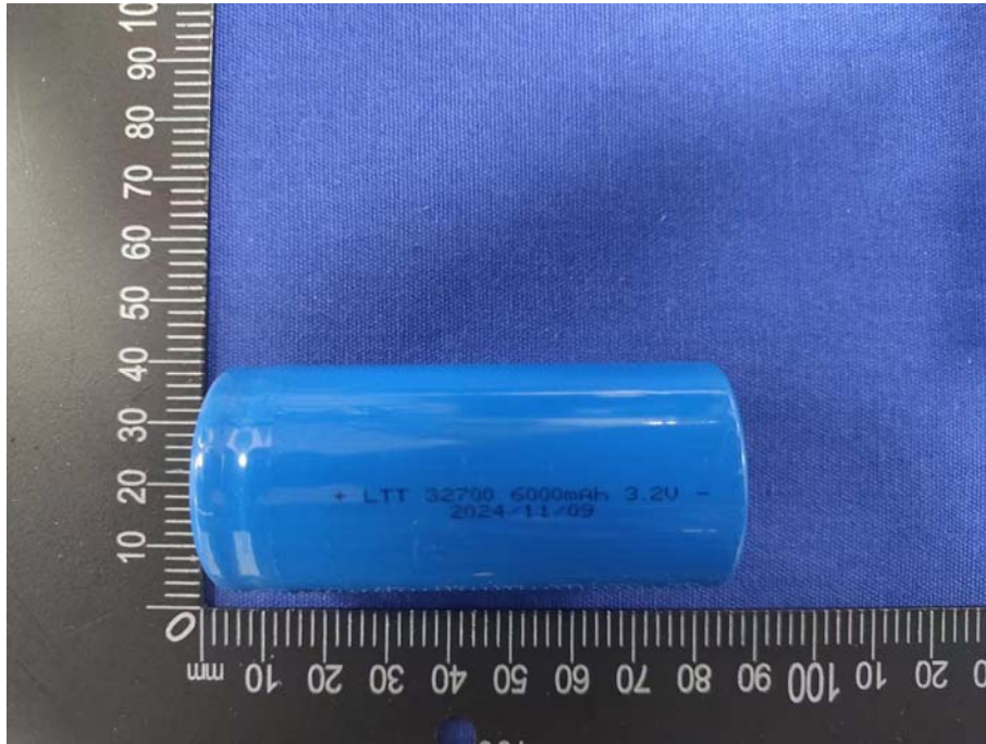
Photo 3 Internal Cell 内部电芯