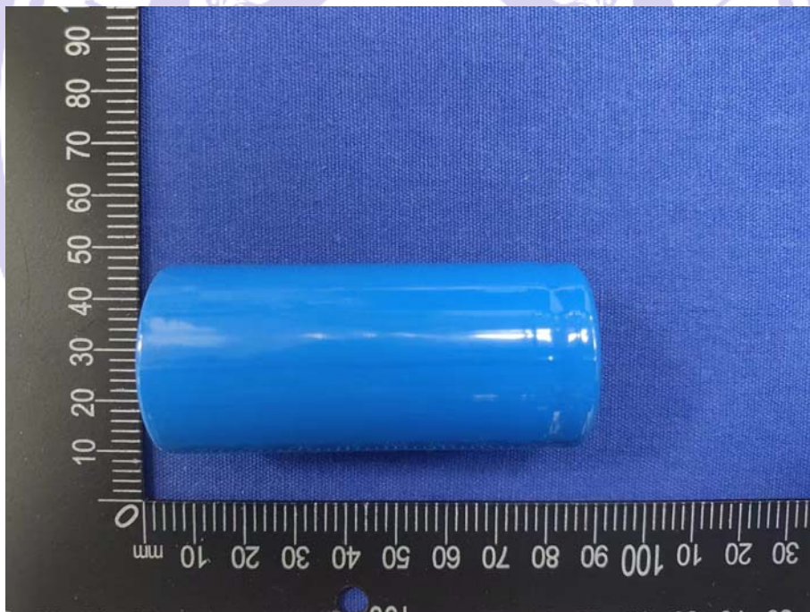
Photo 4 Internal Cell 内部电芯