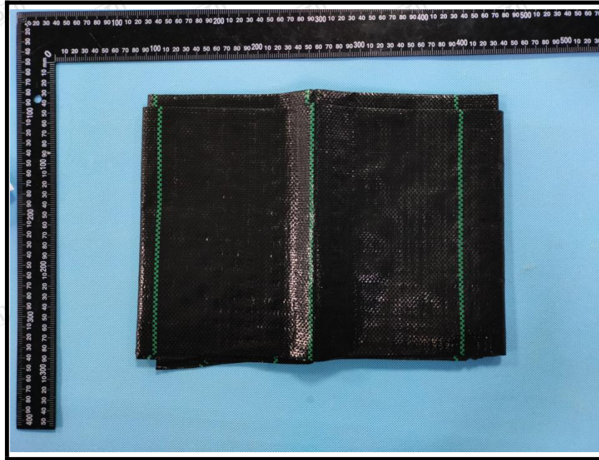
Photograph of Sample