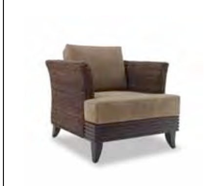
Cancio Contract (profile page 30) Model: Tamia Lounge Chair MOQ: TEU Packaging: Corrugated box Delivery: 30 days Price: $616 Description: Lounge chair; mahogany base, Manila hemp armrests, foam cushion and muslin cover; 35x34x30in