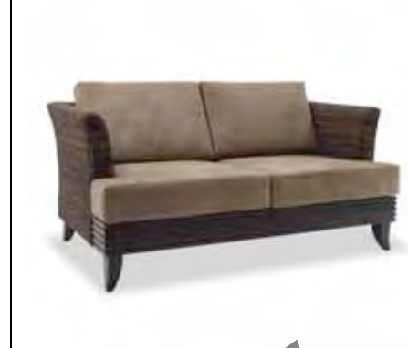
Cancio Contract (profile page 30) Model: Tamia 2-Seater Sofa MOQ: TEU Packaging: Corrugated box Delivery: 30 days Price: $860 Description: Sofa; mahogany base, Manila hemp arm- and backrests, foam cushion, and muslin cover; 62x35x31in