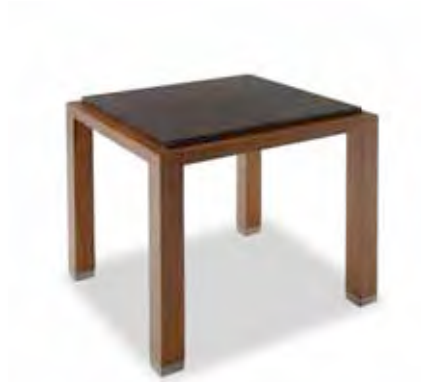
Cancio Contract (profile page 30) Model: Mara Side Table MOQ: TEU Packaging: Corrugated box Delivery: 30 days Price: $32 Description: Side table; mahogany; 22x24x24in