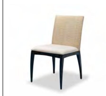
Cebu Natura (profile page 34) Model: Eleganza Side Chair MOQ: 24 pieces Packaging: Kraft paper, master carton Delivery: 90 days Price: $119.94 Description: Living room chair; mahogany frame, rattan backrest, foam cushion and muslin cover; 57.5x46.2x84cm