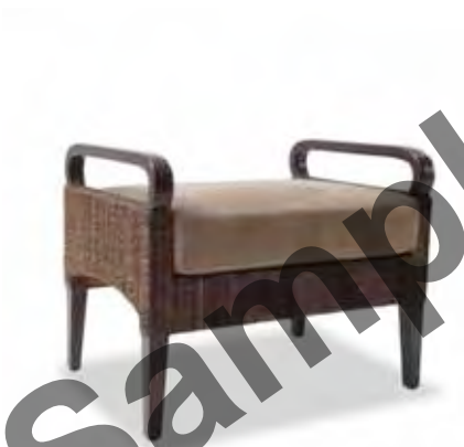
Cancio Contract (profile page 30) Model: Mara Foot Stool MOQ: TEU Packaging: Corrugated box Delivery: 30 days Price: $217 Description: Ottoman; mahogany and Manila hemp base, foam cushion and muslin cover; 26x18x24in