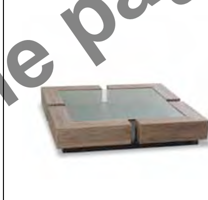
Cebu Natura (profile page 34) Model: Marose Cocktail Table MOQ: 12 pieces Packaging: Kraft paper, master carton Delivery: 90 days Price: $357.10 Description: Cocktail table; mahogany base, Manila hemp body, glass top and veneer surface; 110x110x20.5cm