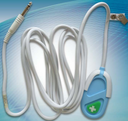
Medical device cable