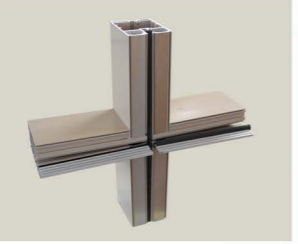
Aluminum profiles for construction