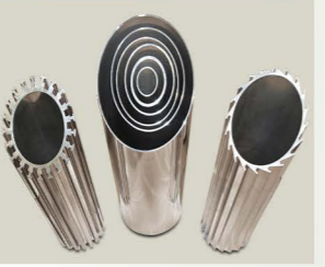
Large cross-section complex aluminum extrusion profiles