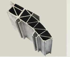
Aluminum extrusion for high-speed train body

Liaoning Zhongwang Group Co. Ltd Tianjin Zhongwang Aluminum Co. Ltd 299 Wensheng St., Liaoyang, Liaoning 111003, China Tel: (86-419) 3690 523 • Fax: (86-419) 4155 591 E-mail: export@zhongwang.com www.globalsources.com/lzhongwang.co • www.zhongwang.com Global Sources Verified Supplier ★★★★★