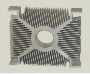
Aluminum extrusion radiator profile