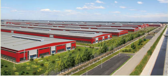
Our branch factory in Tianjin