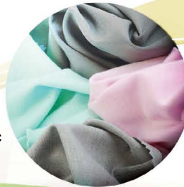
Collagen peptide fabric