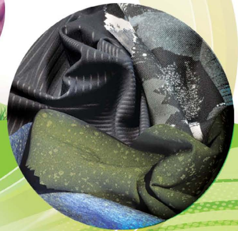
Reflective/rubber printing/ embossed 4-way stretch