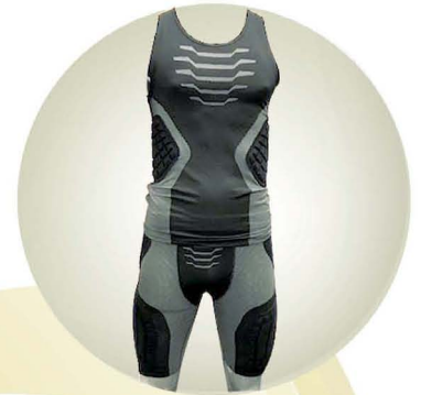
Body-mapping jacquard jersey

Visit us online now to see our full range of fabric.