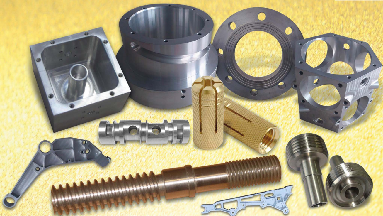
Professional CNC-machined parts