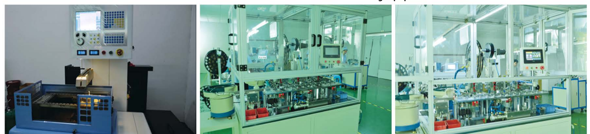
Automated processing equipment