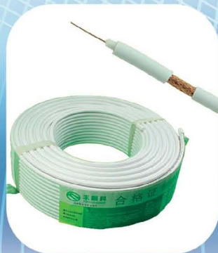
RG6 coaxial cable