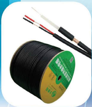
RG59 coaxial and 2C power cable