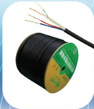
UTP Cat5e and power cable