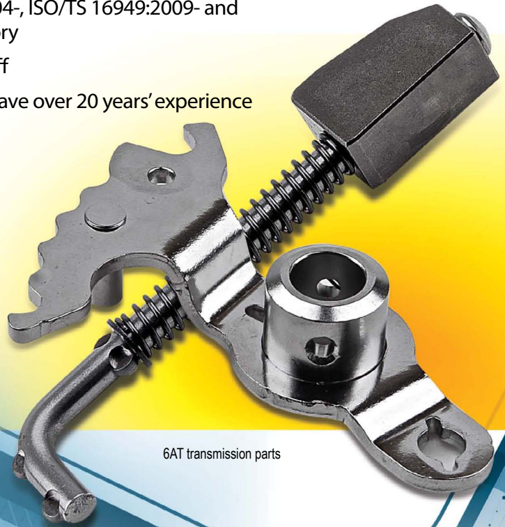
6AT transmission parts