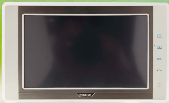
TCP/IP smart home system with 10" touch screen (OP-D9A10)