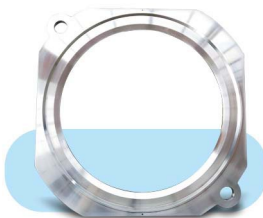
Steel seal plate