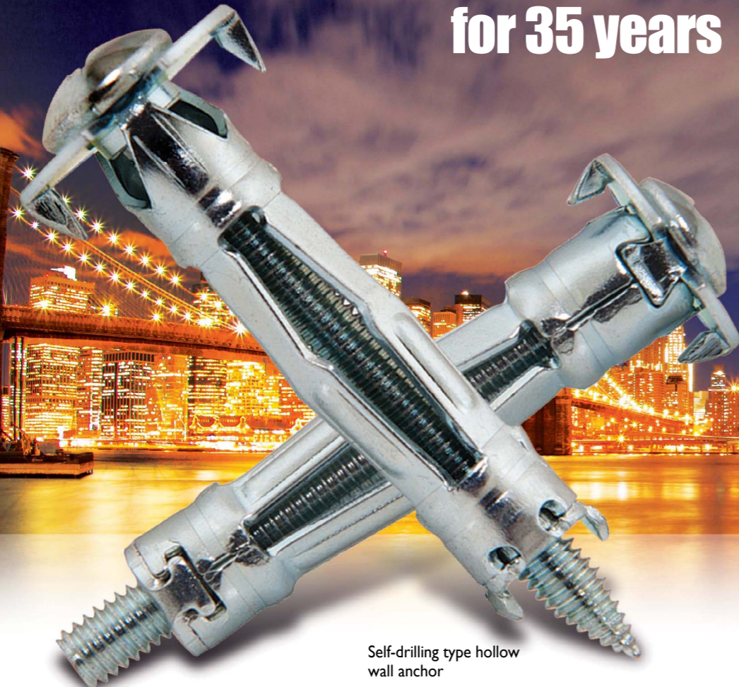
Self-drilling type hollow wall anchor

Get in touch with us today via phone or e-mail.