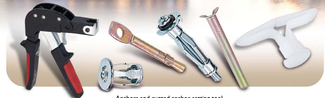
Anchors and rugged anchor setting tool