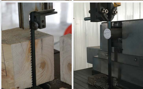
Carbon steel bandsaw blades