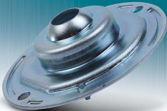
Stamped metal part