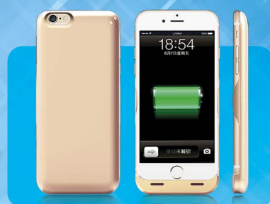
3,000mAh power bank case for iPhone 6s (PC3000)