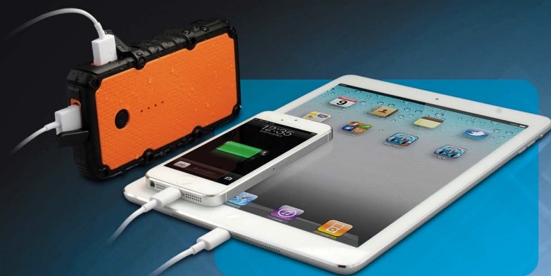
12,000mAh power bank (WP1200) • IP67 rating • Shockproof and easy to clean