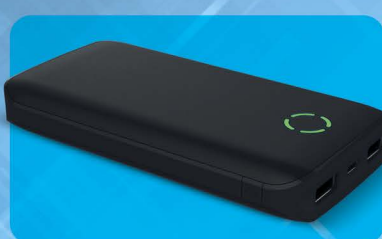
Power bank (YF1000) • 10,000mAh • Quick Charge™ technology