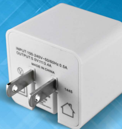
USB Type-C™ wall charger (WAC340SF-A) • Input: 90-240V AC • Output: 5V/3.4A with USB Type-C and USB Type-A ports • Various plugs available