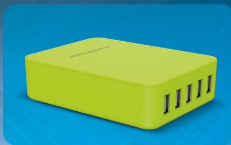
Charging hub with 5 USB ports, 7.8A output (ACR03)