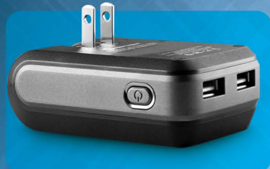
7,000mAh AC power bank (AC700) • 3.1A dual USB output • Built-in AC plug