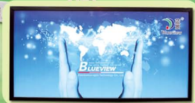
Light with cover