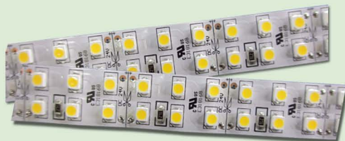
UL-listed double-row LED strips