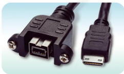
OEM Cable Assembly

Benefit from our 20-plus years of OEM/EMS experience. We provide total turnkey solutions for PCBA's, as well as lines of cable assemblies and Ethernet cards that are sourced by firms such as HP and Epson. From our 6,000m 2 ISO 9001:2000-certified factory in Taiwan, we turn out up to 50,000 RoHS-marked pieces monthly, utilizing 7 high-speed SMT lines from Hitachi and Yamaha. Plus, our English-speaking project managers can facilitate communication between you and our engineers to ensure your specific requirements are followed to the letter. We accept OEM/EMS orders starting at 500 pieces. Call us today.