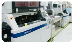
SMT Production Line