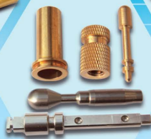
Automatic lathed parts