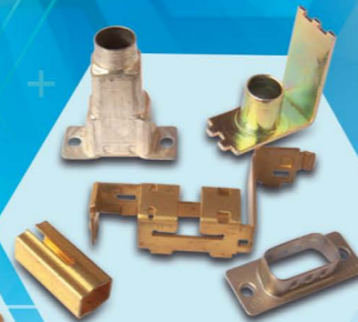
Metal stamped parts