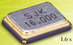
1.6 x 1.2mm