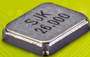
2.5 x 2mm