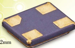
Ultra small SMD crystal oscillators