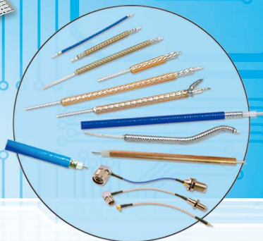
RF coaxial cables and RF/microwave cable assemblies, RG174/178/188/316/405