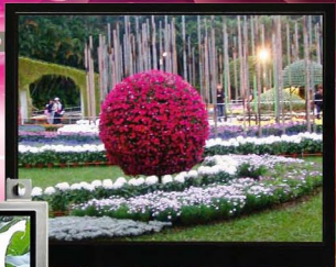
5.7" TFT 320 x 240 display with LCD controller board