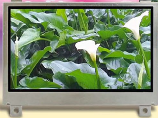
4.3" TFT LCD display with controller board