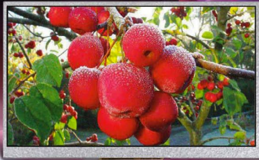
7" TFT LCD display with controller board