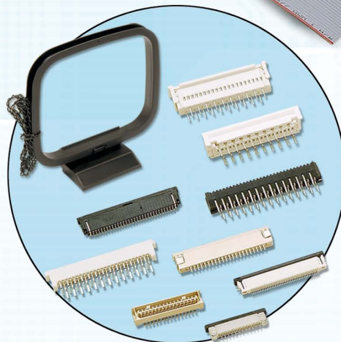
FFC/FPC connectors and AM antenna