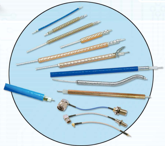
RF coaxial cables and RF/microwave cable assemblies, RG174/178/188/316/405