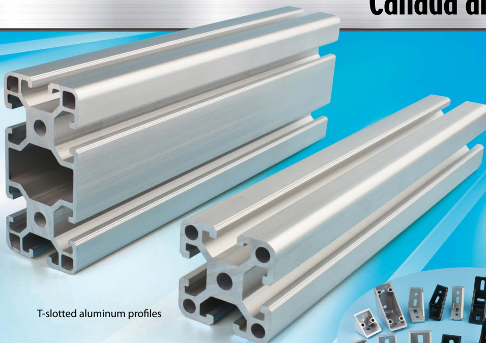
T-slotted aluminum profiles