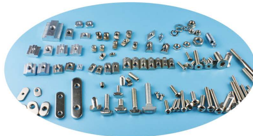
Nuts and bolts