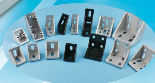
Die-cast right-angle corner brackets made of ADC12