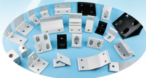
CNC-formed metal connectors made of 6061 T5