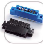
Edge card connectors