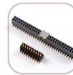
Header and socket