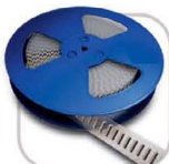
SMD connector reel