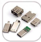
USB Type-C™ connectors