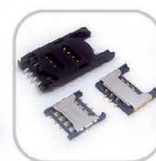
SIM card socket connectors