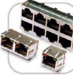
RJ45 modular jacks