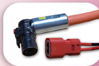
EV cable assembly