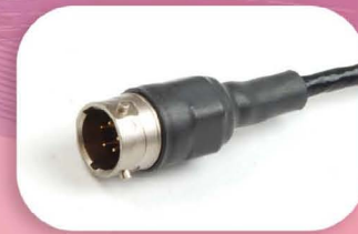
Cable assembly for aerospace equipment