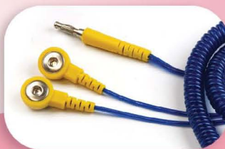
ECG compact snap connector assembly