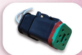
Spec 55 cable assembly