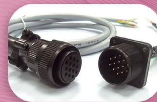
Military cable assembly