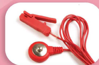
Medical electrode assembly