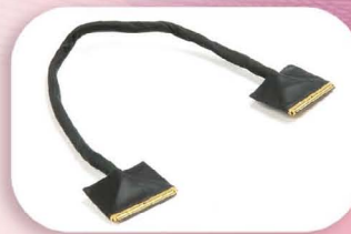
LVDS cables for TFT displays