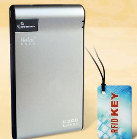
K306 2.5" RFID hard disk • State-of-the-art design with compact size • Sole ID Code key • Anti-shock technology • Solid metal encasing

Our 150 engineers develop up to 50 new models yearly and can integrate the features you want into our existing products. Our ISO 9001:2000- and ISO 14001:2004-certified facilities turn out 1.5 to 2 million units monthly, enough to cover your volume requirements. And we ensure efficient production by using a SAP ERP system. Contact us today.