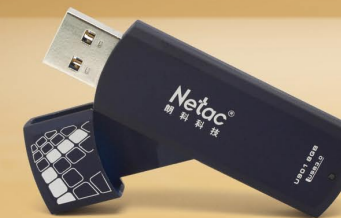
U901 Classic swivel design USB 3.0 drive with transfer rate up to 100Mbps

Samsung, Siemens, IBM, BenQ, HP and Dell are a few of the major electronics brands that trust our design capabilities. After all, we released one of the first ever USB flash drives and currently hold more than 200 patents for a variety of electronics, including hard disk drives, USB flash drives and portable media players. This strong R&D capability ensures you receive only the most innovative items.