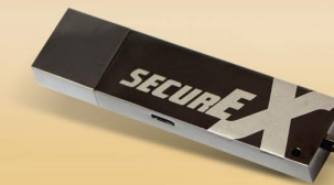
U660 USB flash drive • AES-256 encryption • Dual-disk display