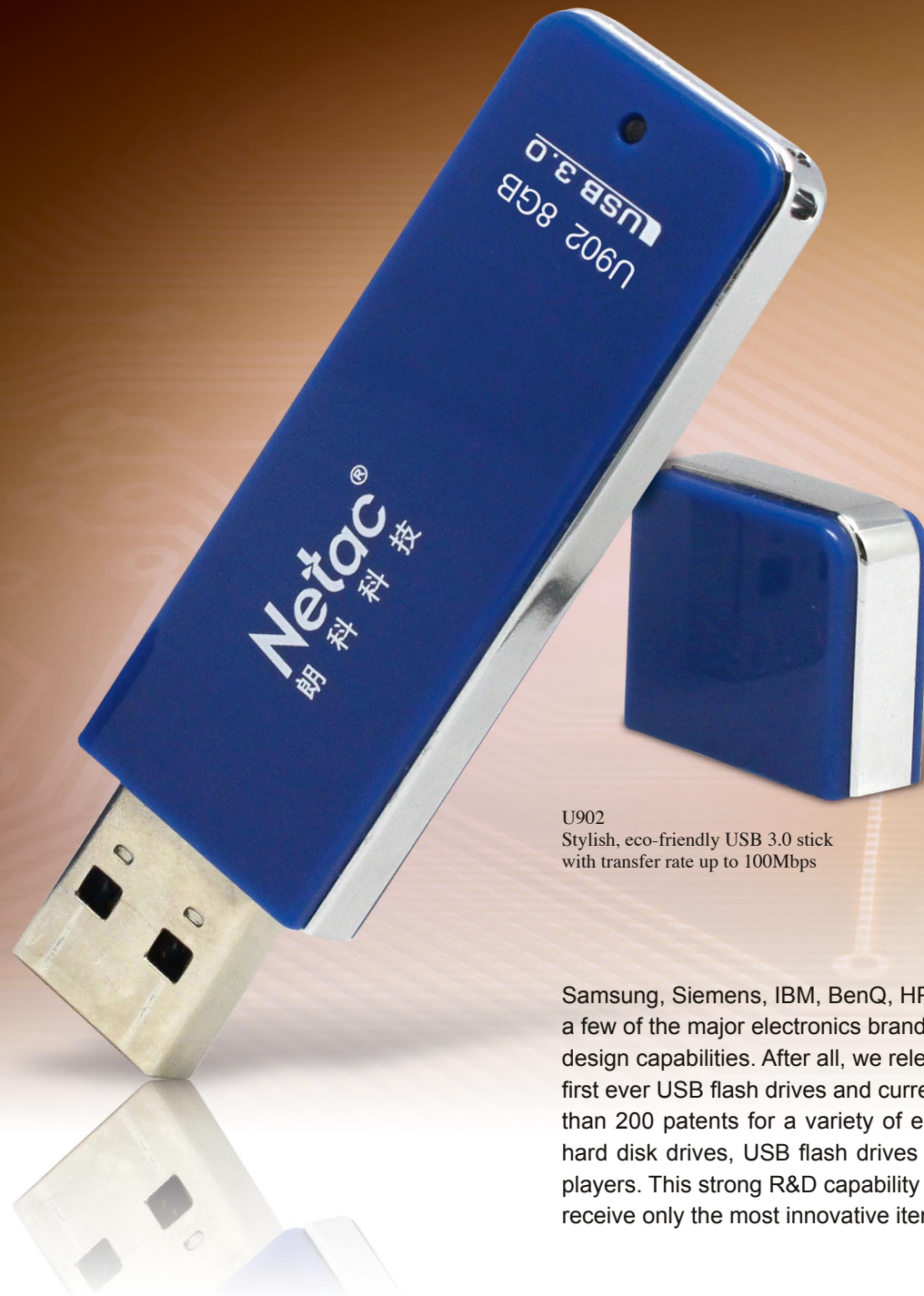
U902 Stylish, eco-friendly USB 3.0 stick with transfer rate up to 100Mbps

a proven innovator gives life to 50 models annually