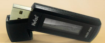
U620 USB flash drive with built-in LCD screen • Customized logo, image and text display • Free space indicator • Free DIY software tool for personalized settings