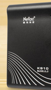
K910 2.5" USB 3.0 hard drive • Business style and fluent line design • Dual data transfer, Hi-speed read & write • Interface transfer rate: 5Gbps • USB 2.0 backwards compatible