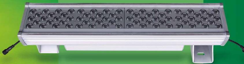
Our latest LED wall washer