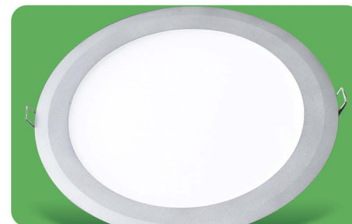
Round LED panel light

For quality, feature-packed LED panel lights, turn to a specialist – us. Not only are our models UL-listed, but they are CE-certified and approved by SGS inspectors. Your customers are sure to appreciate their features too, including adjustable correlated color temperature (CCT) levels of 2,200 to 6,500 kelvin. They also last up to 10 times longer than traditional tube lights and have voltages as low as 12 volts, making them more eco-friendly.