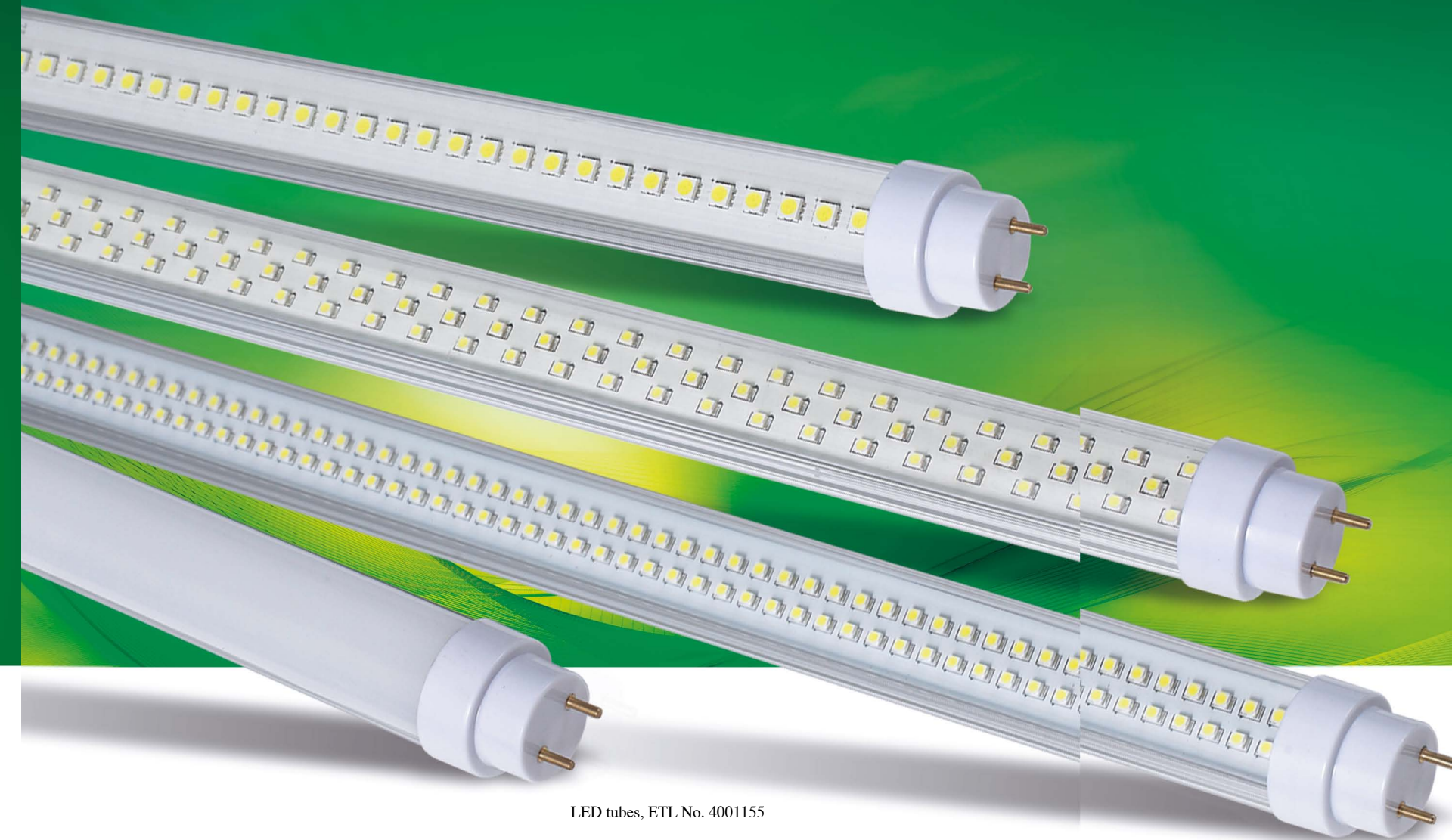
LED tubes, ETL No. 4001155

If your customers are demanding the latest in LED lighting technology, then we have the products for you. Our ETL-approved LED tubes, shown here, are highly stable as they boast isolated drivers. Plus, they also have overload, constant-current, and short- and open-circuit protection. They are also subjected to 4,000-volt shock tests, feature 3528 and 5050 SMD LEDs, and have power factors of more than 0.95.