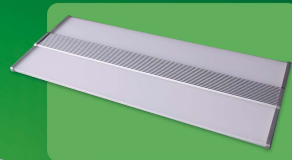
Double-faced slim LED panel light