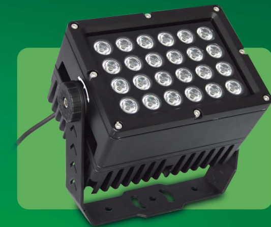
12/24W square LED wall washer • 13 programmable color changes via DMX controller • IP65-rated

Utilizing QC machinery from Germany, our lights are subjected to 18 different inspections, including 48-hour age tests. And our 20 R&D experts design up to 10 new models monthly and complete OEM samples in just one week. To view our full range of LED tubes, wall washers, panel lights, ceiling lights, spotlights, strips, ground lights and modules, contact us today.