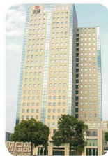
Our office building