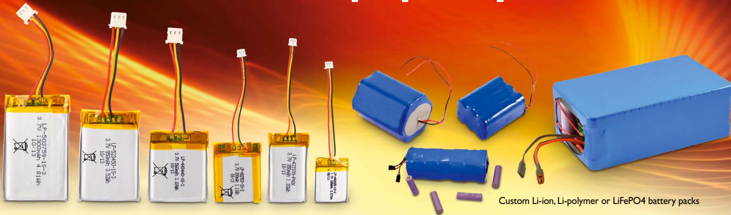
Custom Li-ion, Li-polymer or LiFePO4 battery packs