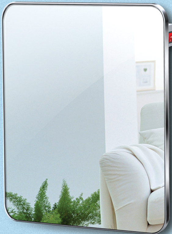
Glass panel heater available in customized colors, can also be used as a bathroom mirror