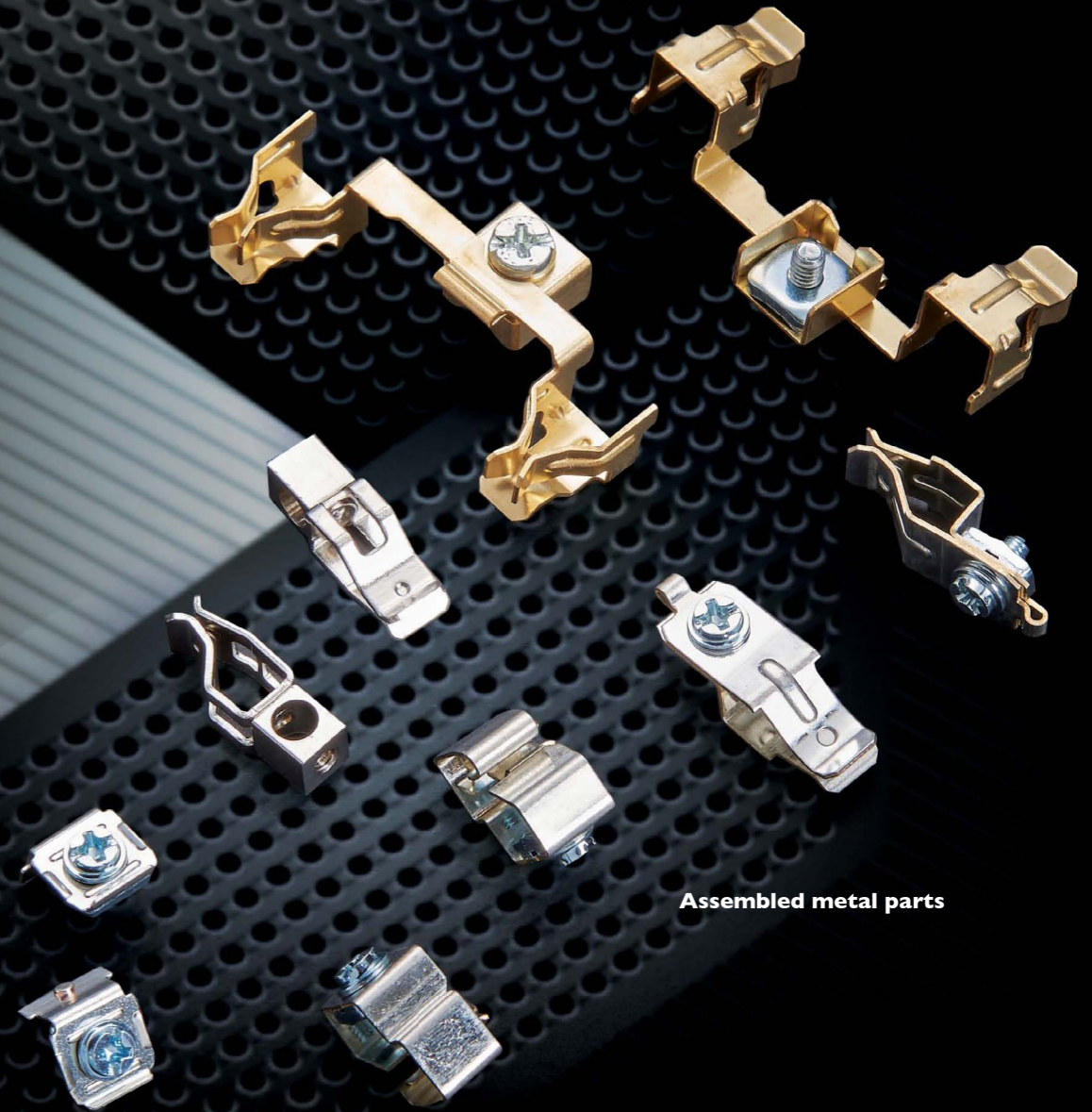
Assembled metal parts