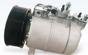
A/C compressor (SE7PV-7SBU) • Internally controlled variable swash plate type • Suitable for Mercedes Benz, Audi and BMW vehicles • Replacement for 7SBU series compressors