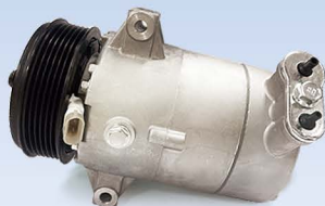
A/C compressor (SE6PV-CVC) • Internally controlled variable swashplate type • Suitable for Chevrolet and Cadillac vehicles • Replacement for CVC series compressors