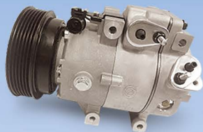
A/C compressor (SE6PV-VS) • Internally controlled variable swash plate type • Suitable for Hyundai and Kia vehicles • Replacement for VS series compressors