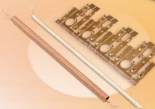
Precision springs and stamped parts