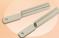
Brass pins with matte tin plating