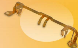
Phosphor bronze grounding bracket