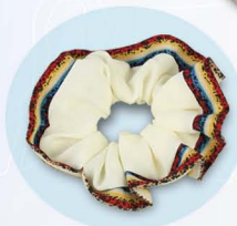
Various hair accessories available