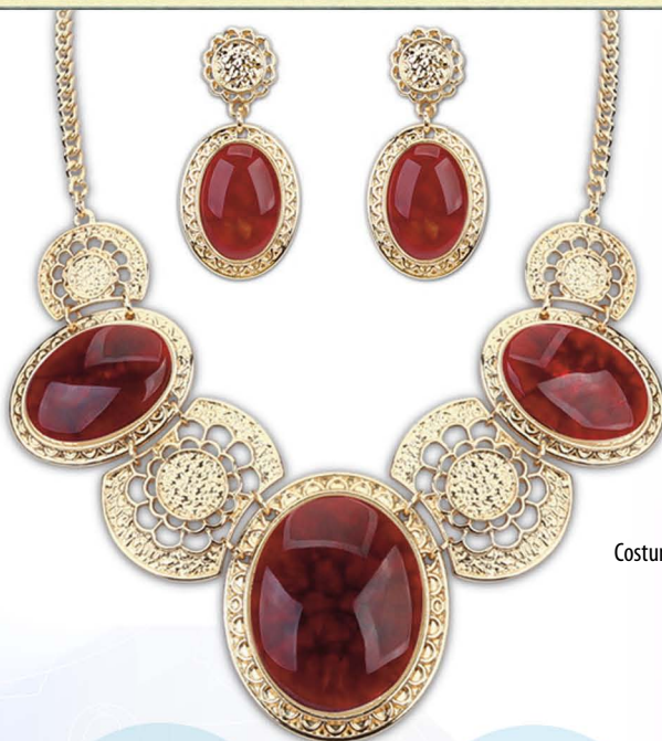
Costume jewelry set

Walmart, Target, Disney and L'Oréal come to us