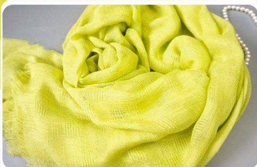
Textured woven scarf

Kimono shawl with printed butterflies design