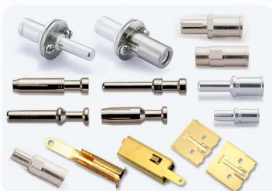
Terminals and pins