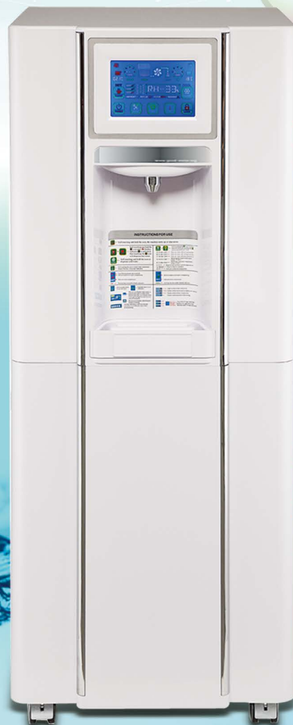
Touch-screen RO water dispenser