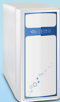
RO water purifier