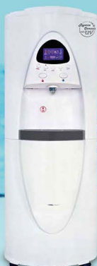
RO water cooler