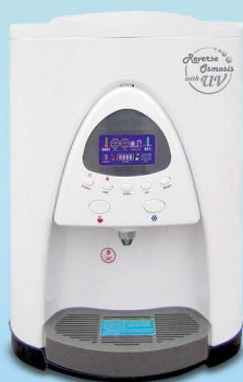
RO water cooler