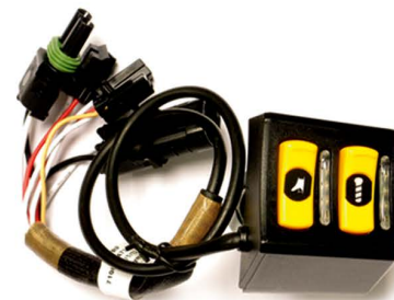
Advanced digital thermal control