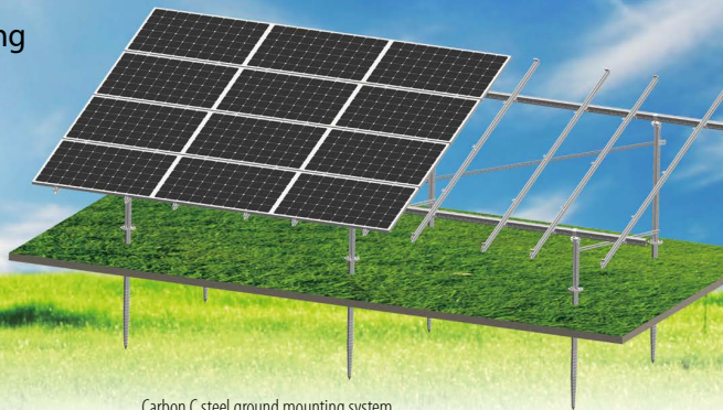
Carbon C steel ground mounting system