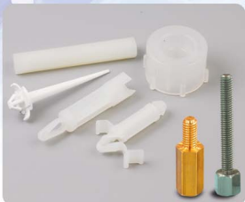
PCB spacer supports