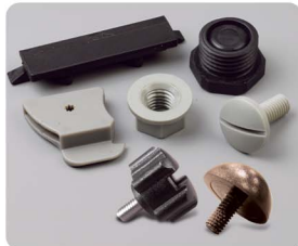
Plastic feet, handle and card guide