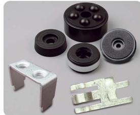
PCB terminal parts