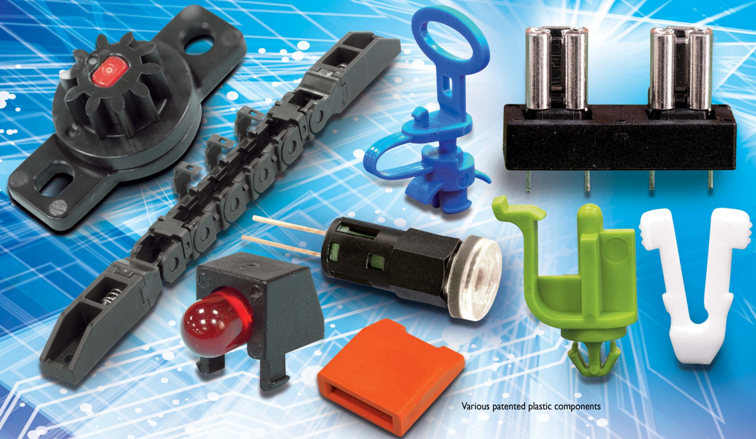
Various patented plastic components