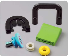
Hold plugs and strain relief bushings