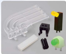
LED spacer, holders and light pipes