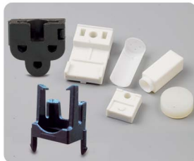
Various spare plastic parts