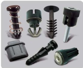
Plastic screws and nut