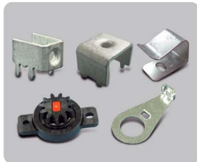
PCB terminals and plastic gear